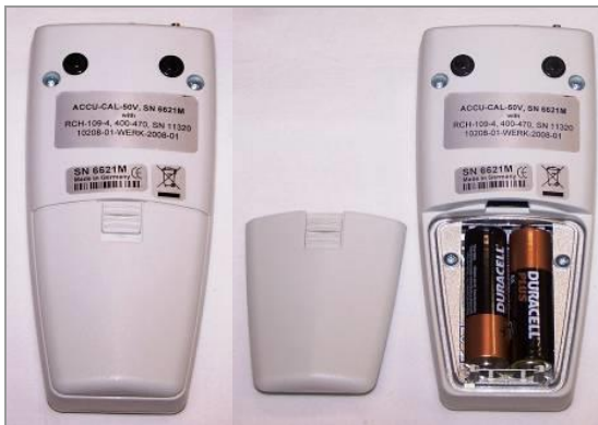
Figure 8. Battery Compartment (Closed & Open)