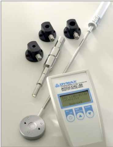
Figure 1. Spot Radiometer (PN39560)