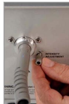
Intensity adjustment knob for fingertip adjustment