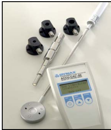
ACCU-CAL™ 50 Radiometer for measuring the UV intensity of spot lamps, flood lamps, and conveyor systems PN 39560