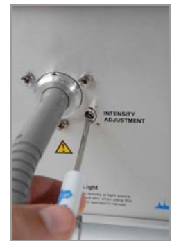
Intensity adjustment, with knob removed, performed with adjustment tool