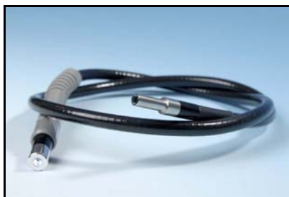
Liquid Lightguides available in 1, 2, 3 and 4-pole configurations (see Table 1 on page 3 for sizes and part numbers)