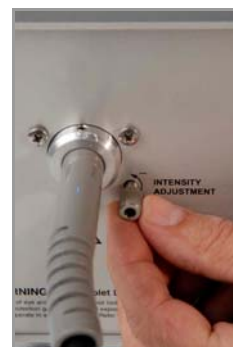
Intensity adjustment knob for fingertip adjustment