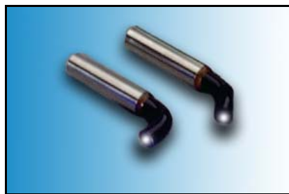
Angled Terminators for Lightguides 3 mm/60° PN 39029 ■ 3 mm/90° PN 39030 5 mm/60° PN 38042 ■ 5 mm/90° PN 38049