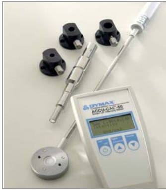
ACCU-CAL™ 50 Radiometer for measuring the UV intensity of spot lamps, flood lamps, and conveyor systems PN 39560