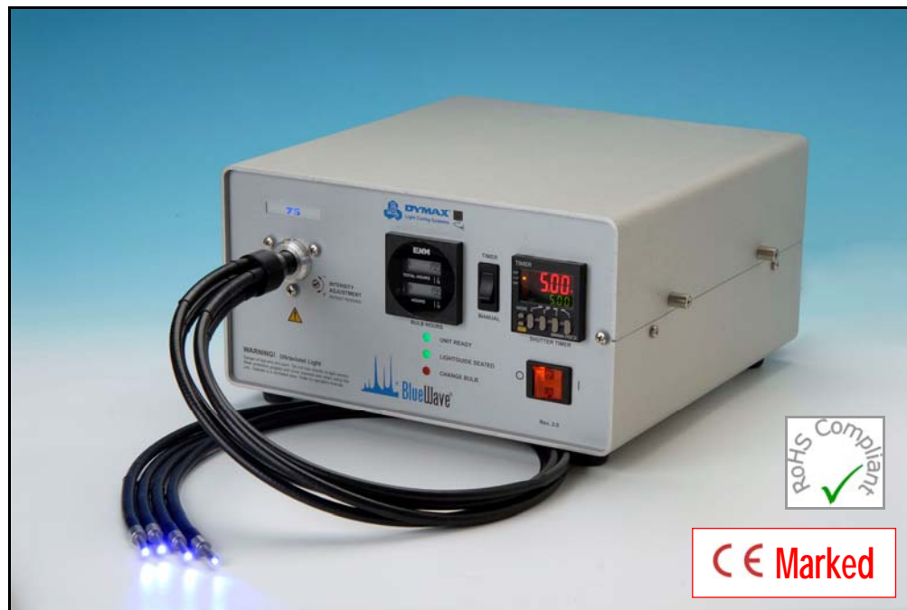
BlueWave 75 UV-Curing Spot Lamp with Intensity Adjustment and Four-Pole Lightguide

The BlueWave 75 spot lamp emits UVA and blue visible light (300-450 nm) and is designed for curing of UV and visible light curable adhesives, coatings and encapsulants. It contains an integral shutter which can be actuated by a foot pedal making it ideal for both manual and automated processes. An auto-ranging power supply provides consistent performance at any input voltage (90-264V, 47-63 Hz). DYMAX also offers a wide range of long-lasting liquid and fiber lightguides in single, multi-legged, and various length configurations.