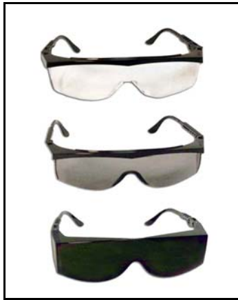
UV Protective Safety Goggles Clear PN 35284 Tinted PN 35285 Dark Tint PN 35286