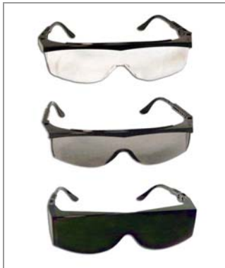
UV Protective Safety Goggles Clear PN 35284 Tinted PN 35285 Dark Tint PN 35286