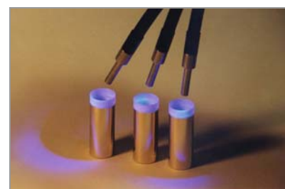
Trifurcated wand curing metal-to-plastic assembly