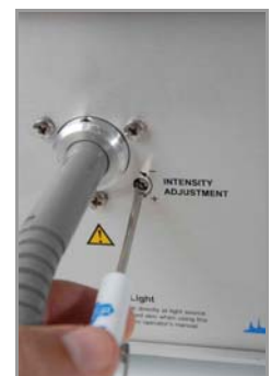
Intensity adjustment, with knob removed, performed with adjustment tool