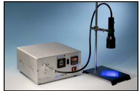
Rod Lenses Shown: BlueWave 75 with 8 mm rod lens (rod lenses require an 8 mm lightguide) 2" x 2" Area (~100 mW/cm 2 ) PN 38699 5" x 5" Area (~30 mW/cm 2 ) PN 38698