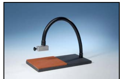
Lightguide Mounting Stand (fits 3 mm, 5 mm and 8 mm lightguides) PN 39700