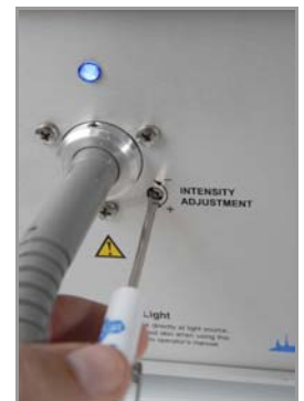
Intensity adjustment, with knob removed, performed with adjustment tool