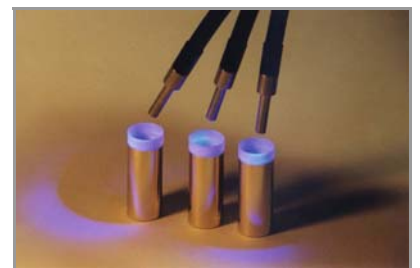
Trifurcated wand curing metal-to-plastic assembly

1 As measured with a DYMAX ACCU-CAL™ 50 Radiometer (320-395 nm). Excessive on/off cycles and improper cooling may affect bulb degradation and therefore no warranty is expressed or implied.