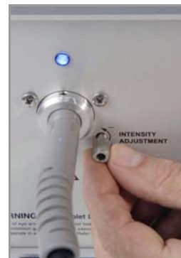
Intensity adjustment knob for fingertip adjustment