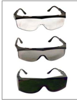
UV-Blocking, Over-the-Glasses Eye Protection Clear PN 35284 ■ Tinted PN 35285 Dark Tint PN 35286