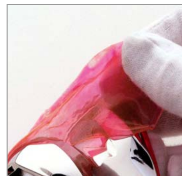
Remove cured mask by peeling