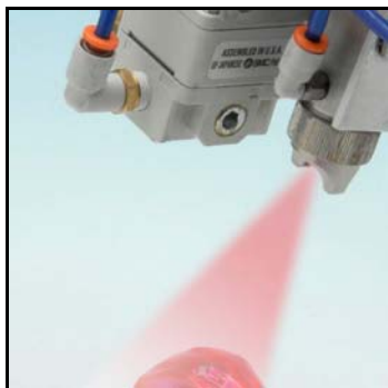
Spray resin onto knee implant