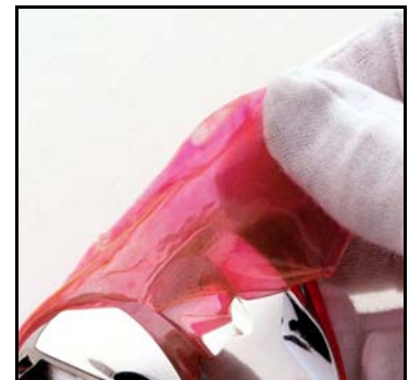
Remove cured mask by peeling