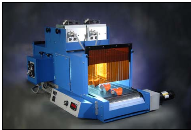
Cure masked knee implants in seconds in DYMAX conveyor