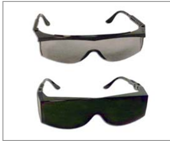
UV Protective Safety Goggles Grey PN 35285 Green PN 9162044