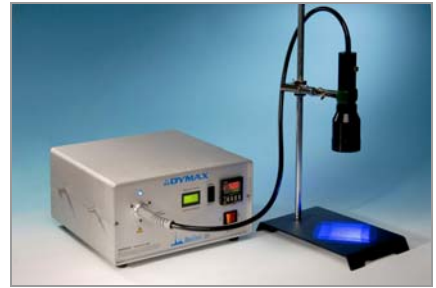
Rod Lenses Shown: BlueWave 75 with 8 mm rod lens (rod lenses require an 8 mm lightguide) 50 mm x 50 mm Area (~100 mW/cm 2 ) PN 38699 127 mm x 127 mm Area (~30 mW/cm 2 ) PN 38698