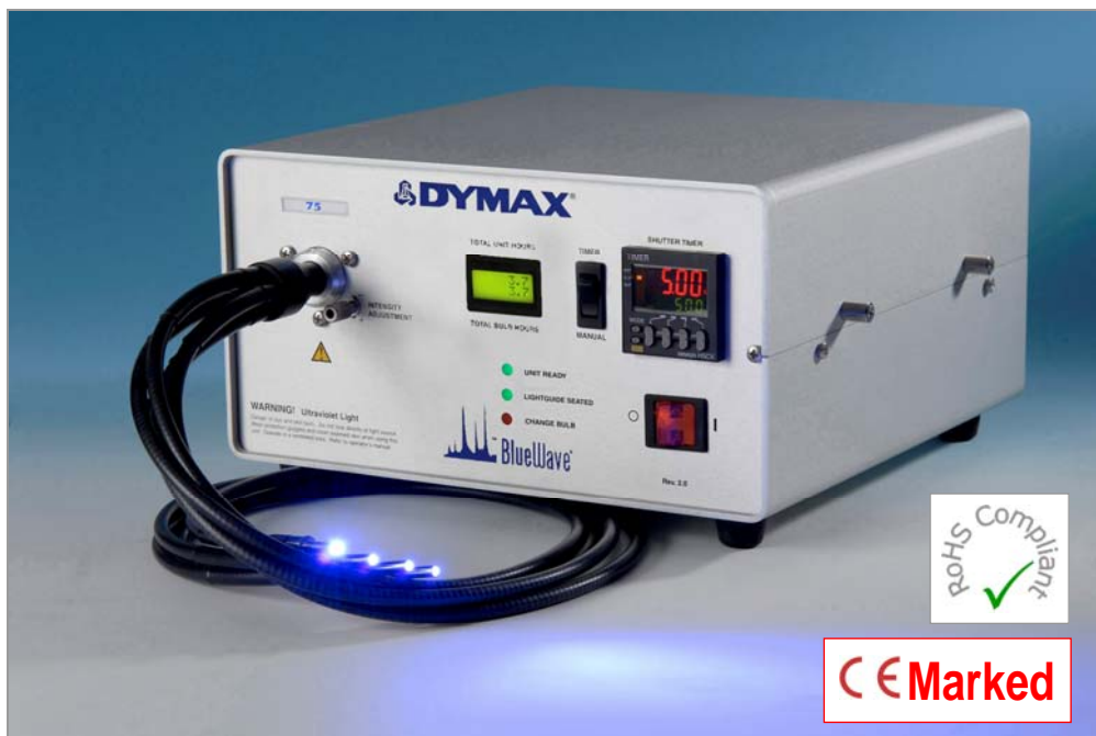
BlueWave 75 UV-Curing Spot Lamp with Patented Intensity Adjustment and Four-Pole Lightguide

The BlueWave 75 spot lamp emits UVA and blue visible light (300-450 nm) and is designed for curing of UV and visible light-curable adhesives, coatings, and encapsulants. It contains an integral shutter which can be actuated by a foot pedal or PLC making it ideal for both manual and automated processes. An auto-ranging power supply provides consistent performance at any input voltage (90-264V, 47-63 Hz). DYMAX also offers a wide range of long-lasting liquid and fiber lightguides in single, multi-legged, and various length configurations. The BlueWave 75 with intensity adjustment is the most versatile, user-friendly, and reliable spot cure unit available.