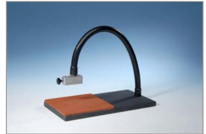
Lightguide Mounting Stand (fits 3 mm, 5 mm and 8 mm lightguides) PN 39700