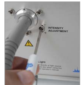
Intensity adjustment, with knob removed, performed with adjustment tool