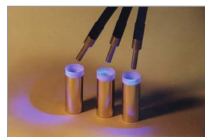
Trifurcated wand curing metal-to-plastic assembly

1 As measured with a DYMAX ACCU-CAL™ 50 Radiometer (320-395 nm). Excessive on/off cycles and improper cooling may affect bulb degradation and therefore no warranty is expressed or implied.