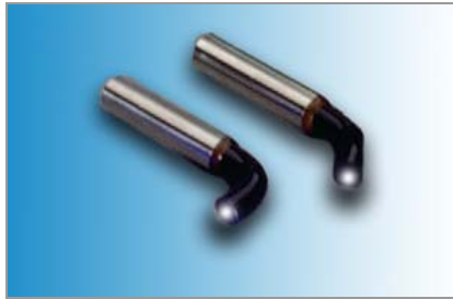
Angled Terminators for Lightguides 3 mm/60° PN 39029 ■ 3 mm/90° PN 39030 5 mm/60° PN 38042 ■ 5 mm/90° PN 38049