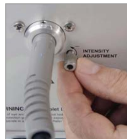
Intensity adjustment knob for fingertip adjustment