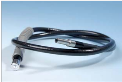
Liquid Lightguides available in 1, 2, 3 and 4-pole configurations (see Table 1 on page 3 for sizes and part numbers)