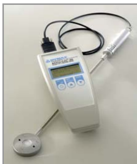
Radiometers for Process Control