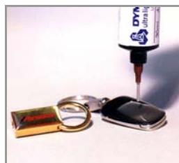
DYMAX 4-20508 with a high-gloss finish is used to coat key chains.