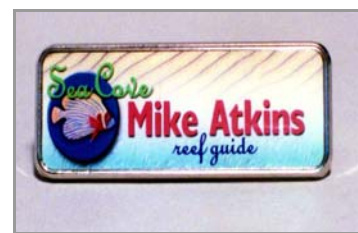
DYMAX 4-20508 is used as a high-gloss dome coating on a nameplate.