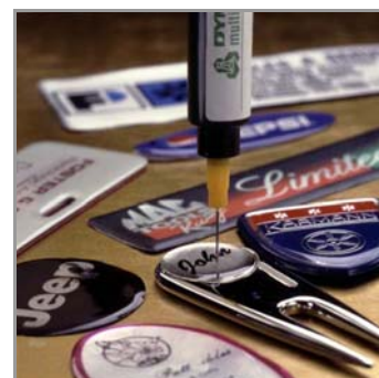
Dome-Coated Novelty Products