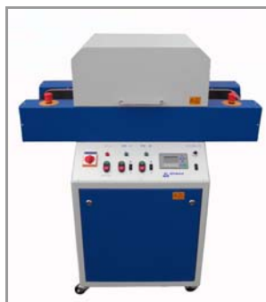
Conveyorized Curing Systems