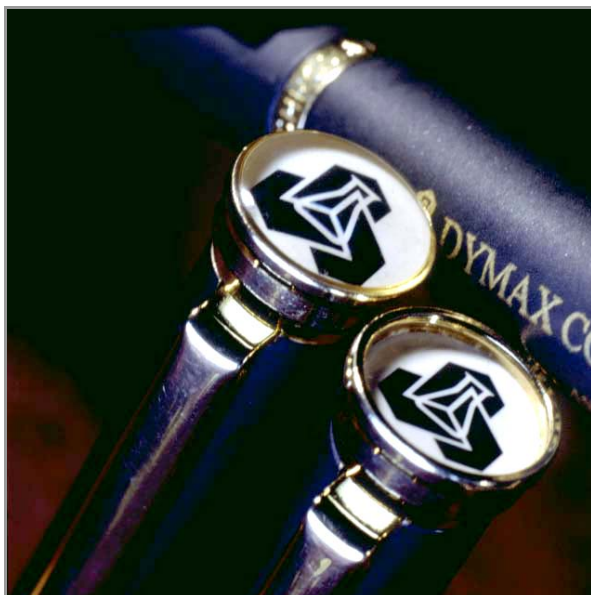
Dome-Coated Pen Tops

DYMAX Light-Weld® and Ultra Light-Weld® light-curable dome coatings create crystal-clear protective coatings in seconds upon exposure to ultraviolet light. The instant, on-demand cure "locks out" airborne contamination. Optimized product flow allows consistent shape, producing consistent domes, resulting in fewer rejects. The higher-viscosity coatings are engineered for producing curved domes, which optically magnify and enhance the appearance of labels and images. Fast cure times allow for greater productivity and less inventory. No mixing, racks, or ovens are required. UV curable dome and decorative coatings are solvent free and do not contain mercury or isocyanates. Light-curable dome and decorative coatings are ideal for coating labels, badges, nametags, pens, key chains, decals, and novelties.