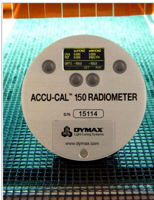
ACCU-CAL 150 for measuring UV light emitted from UV light-curing flood lamps and conveyor systems only (PN 40550)

Simple to Operate ■ PTB and NIST Traceable ■ CE Marked