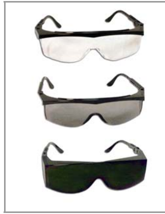
UV-Blocking, Over-the-Glasses Eye Protection Clear PN 35284 ■ Tinted PN 35285 Dark Tint PN 35286