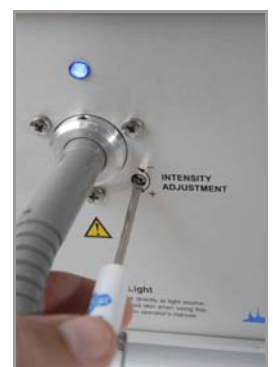
Intensity adjustment, with knob removed, performed with adjustment tool