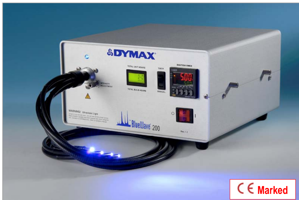
BlueWave 200 Light-Curing Spot Lamp with Patented Intensity Adjustment and Four-Pole Lightguide

The BlueWave 200 spot lamp primarily emits UVA and blue visible light (300-450 nm) and is designed for light curing of adhesives, coatings, and encapsulants. It contains an integral shutter which can be actuated by a foot pedal or PLC making it ideal for both manual and automated processes. A universal power input provides consistent performance at any voltage (90-264V, 47-63 Hz). DYMAX also offers a wide range of long-lasting lightguides including liquid/fiber, single/multi-pole, and lightguides in various lengths. The BlueWave 200 with manual intensity adjustment is the most versatile, user-friendly and reliable light-curing spot lamp available.