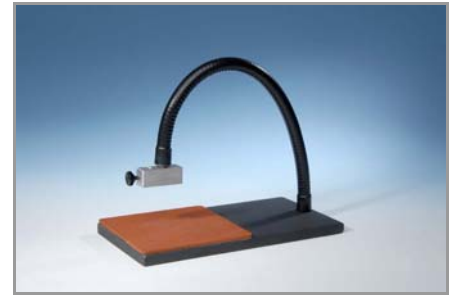
Lightguide Mounting Stand (fits 3 mm, 5 mm and 8 mm lightguides) PN 39700