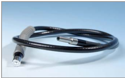
Liquid-Lightguides available in 1, 2, 3 & 4-pole configurations (see Table 1. on Page 2 for sizes and part numbers)