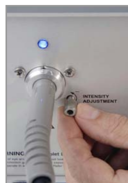
Intensity adjustment knob for fingertip adjustment