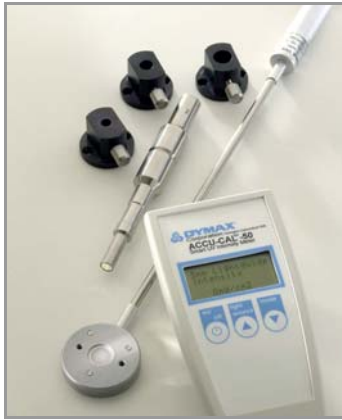
ACCU-CAL™ 50 Radiometer for measuring the UV intensity of spot lamps, flood lamps and conveyor systems PN 39560