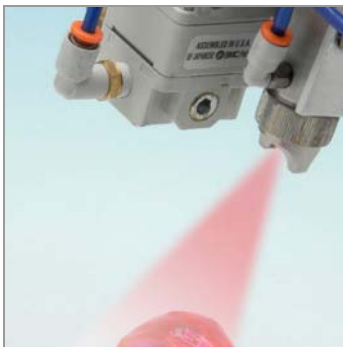
Spray resin onto knee implant