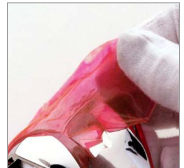
Remove cured mask by peeling