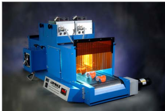
Cure masked knee implants in seconds in DYMAX conveyor