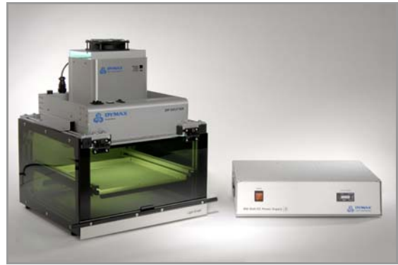
DYMAX 5000 UV Curing Flood Lamp System Shown with Light Shield protective enclosure and ZIP™ shutter. Ideal for single-component or batch-curing processes requiring moderate intensity and a 5" x 5" (12.7 cm x 12.7 cm) cure area. CE Marked. PC Series Flood Systems available for European production facilities.

For further assistance with adhesive and equipment selection, contact your DYMAX Applications Engineer.