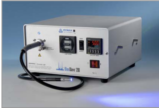
DYMAX BlueWave® 200 UV Curing Spot Lamp with patent-pending intensity adjustment feature provides high-intensity UV/Visible light in a concentrated area. Ideal for integration with automated equipment and multiple-output lightguides. CE Marked.

Tired of short storage and shelf life, of mixing two components, and waiting for adhesives to thaw? DYMAX UV light curing adhesives and systems cure completely in seconds. Make automation easier!