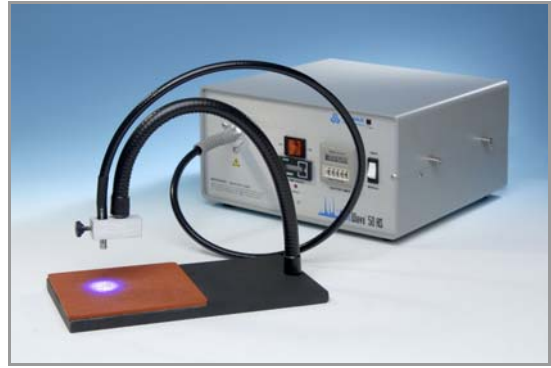
DYMAX BlueWave® 50 AS UV Curing Spot Lamp Shown with single lightguide and lightguide stand provides curing efficiency, low operating cost, and an auto-switching power supply to neutralize the effects of variations in line voltage.