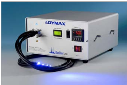
BlueWave® 200 UV Light-Curing Spot Lamp with patent pending intensity adjustment feature provides high-intensity UV/visible light in a concentrated area. Ideal for integration with automated equipment and multiple output lightguides. CE Marked.