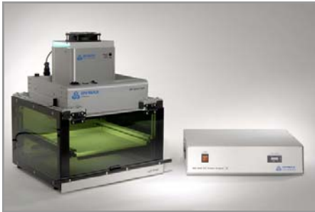
5000 UV Light-Curing Flood Lamp Systems with shutter and protective enclosure. Ideal for single-component or batch-curing processes requiring moderate intensity and a 5" x 5" (12.7 cm x 12.7 cm) cure area. CE Marked PC Series Flood Systems available for European production facilities.

Our technical specialists are ready to help you optimize your process, and maximize your profit and product performance. For resin and equipment selection assistance, please call the DYMAX Applications Engineering Department.