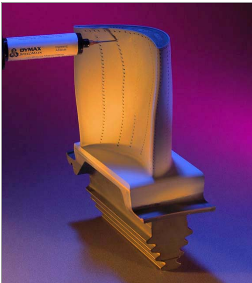
Apply resin to cooling holes

*Cure time based upon DYMAX 5000-EC Light-Curing Flood Lamp System (200 mW/cm 2 )