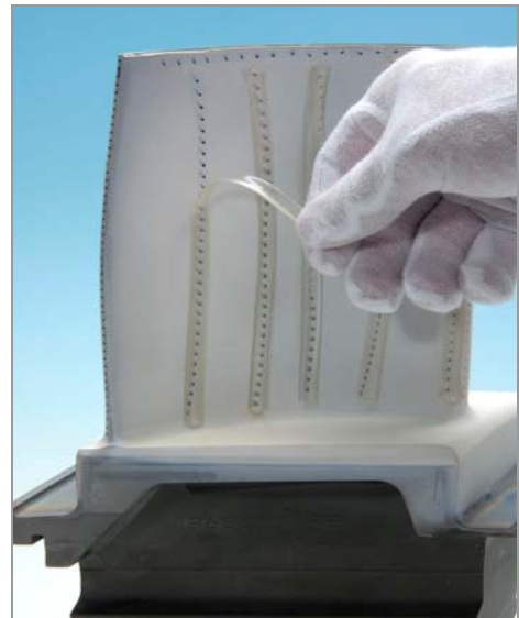
Remove cured resin by peeling