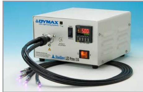
BlueWave® LED Prime UVA Light-Curing Spot Lamp Unit generates high-intensity curing energy with LEDs so there are no bulbs to change, cool cures, no warm-up, and constant intensity for thousands of hours. CE Marked.