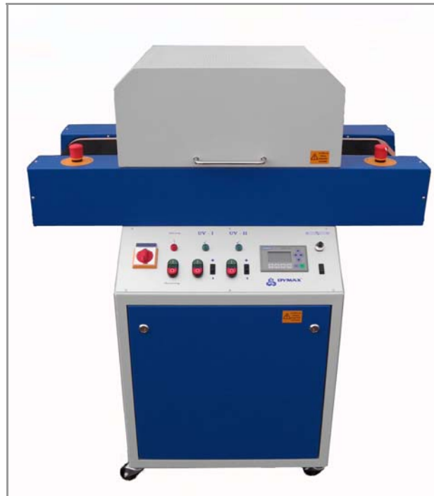
Cure masked turbine blades in seconds in DYMAX conveyor

*Cure time based upon DYMAX 5000-EC Light-Curing Flood Lamp System (200 mW/cm 2 )