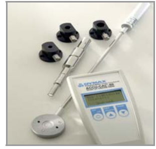
ACCU-CAL™ 50 Radiometers are perfect for process monitoring of spot and flood UV light-curing systems. CE Marked.