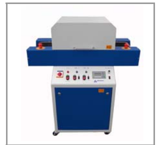
UVCS UV Light-Curing Conveyor Systems Ideal for providing consistent curing for high-volume and high-speed assembly. CE Marked.