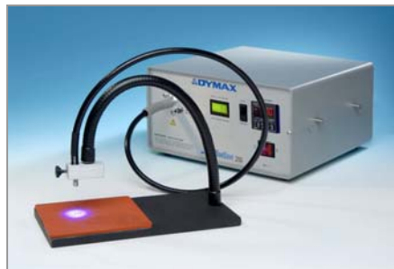
Lightguide Stand Keeps Lightguide Stationary. Log onto www.dymax.com for more information on this and other DYMAX light-curing equipment accessories.