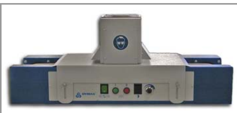
UVCS UV Light-Curing Conveyor Systems Ideal for providing consistent curing for high-volume and high-speed assembly. CE Marked.